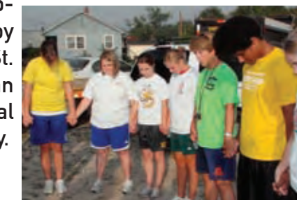
Scholarship Dollars Awarded

with local service organizations, such as the Salvation Army, Operation Food Search, the Judevine Center, and Orphan Grain Train. In August, students at Lutheran High St. Charles (photo, below) stopped to pray before volunteering at a Thrivent-sponsored "Habitat for Humanity" work site in Wentzville. The school's Future Business Leaders of America (FBLA) chapter also pitched in by helping the city of St. Peter's Operation Clean Stream during National Make a Difference Day.