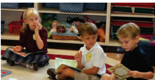
Kindergarteners at Our Savior Lutheran in Fen-ton read together on the meeting rug while their teacher helps their classmates unpack for the first day of school.