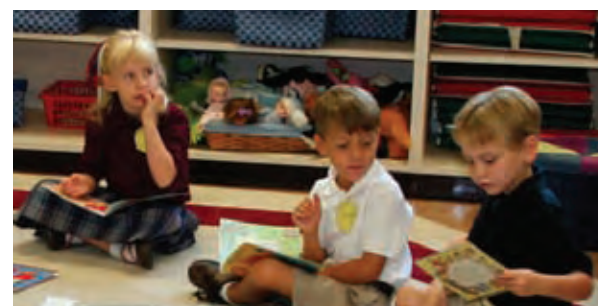
Kindergarteners at Our Savior Lutheran in Fen-ton read together on the meeting rug while their teacher helps their classmates unpack for the first day of school.